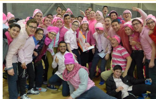
Pink Day 2016

This coming Wednesday, February 8th, marks the international observance of Pink Day to benefit Sharsheret. As you may be aware, the entire Pink Day designation originated here at TABC and is now recognized worldwide. All students, faculty and staff members are invited to come in their pink best.